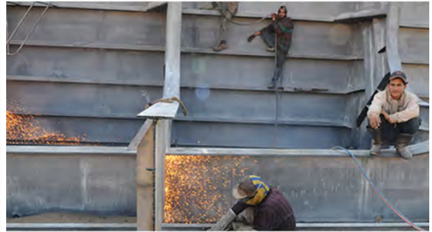
The Political Economy of Social Transformation An International Conference at Sarah Lawrence College